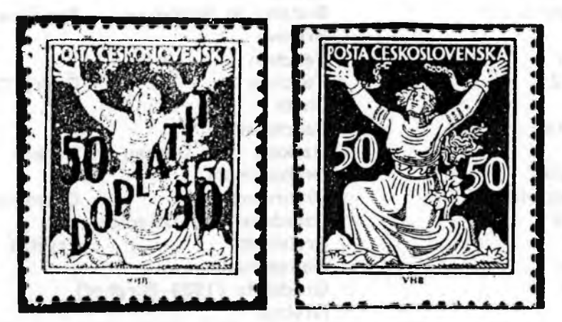
This forgery on SG. 207 and the proper stamp for error

Some weeks ago I was shown a forgery of this error. It had turned up in a mixed lot.