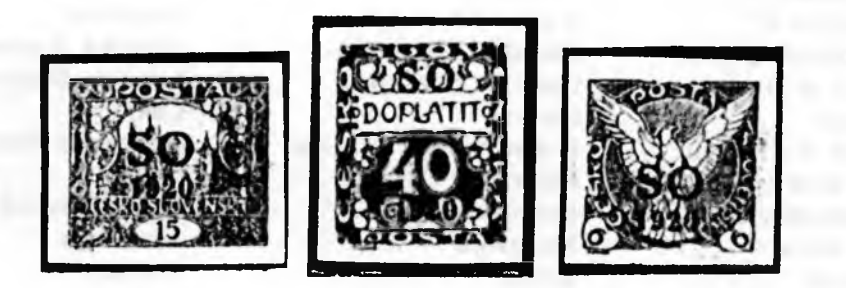
- Examples of Czech overprints -

The Czech S.O. overprints were withdrawn on 11th August 1920 and the Polish set became invalid on 10th September 1920.